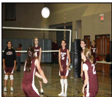
JV and Varsity lady warriors warm up before a home game.

Varsity Volleyball is nearing the end of its season. The lady warriors are currently 8-8 on the season. They recently received the Sportsmanship Award at the Columbia, Mo. tournament.