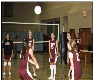
JV and Varsity lady warriors warm up before a home game.

our school very well. People speak highly of Life Way across the state because of their actions everywhere they go, no matter what they are doing. One of the ways you can show your appreciation for them and the junior high, who are following in their footsteps, is by supporting them when they are playing at home or in close proximity. This week is just such an opportunity. Friday, Nov. 18, all of our teams will be in action again. However, we will be playing in different ven-